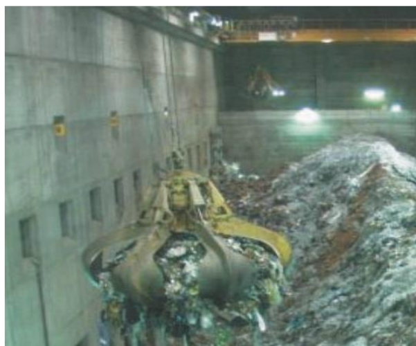
Picture credits: Thermal Waste Treatment Plant in Plzeň, Czech Republic; picture top right: Assembly of a reciprocating grate Vario; picture bottom right: waste grab. All pictures with kind permission of Martin GmbH für Umwelt- und Energietechnik.